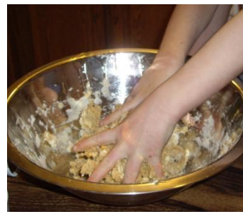
Rubbing in to mix fat and flour if making a yeast based product