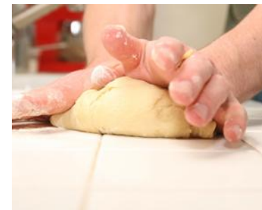
Kneading a bread dough