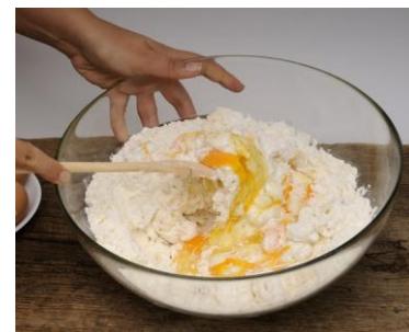
Mixing to combine ingredients if making savoury muffins or scones